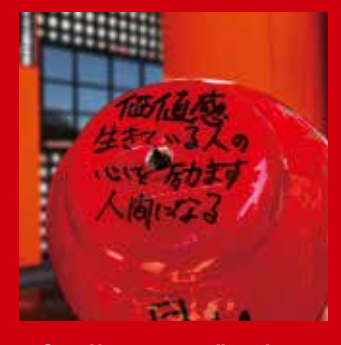
3. Specify your overall goal

Write the immediate goal you would like to achieve over the next year on the back of the Kachi-Daruma.