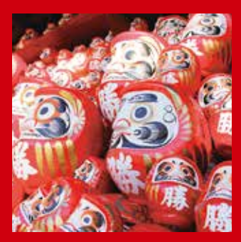
8. Report your achievement and dedicate your Kachi-Daruma

After you have achieved your goal, fill in the Kachi-Daruma's left eye (on your right when facing the Kachi-Daruma) as proof of your achievement.