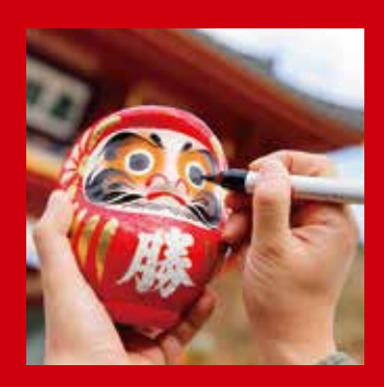
7. Complete the Kachi-Daruma (by achieving your goal)

Vow that you will make no compromise and spare no effort in achieving your immediate goal, and then fill in the Kachi-Daruma's right eye(on your left when facing the Kachi-Daruma).